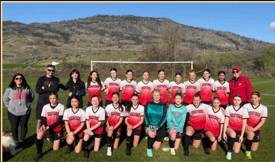
APRIL SOCCER TOURNAMENT AT OSS